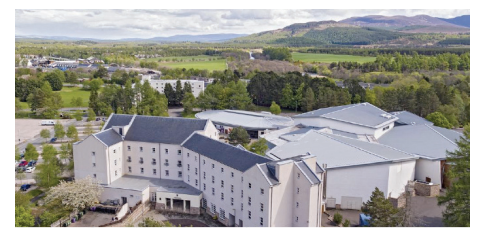
Macdonald Morlich Hotel