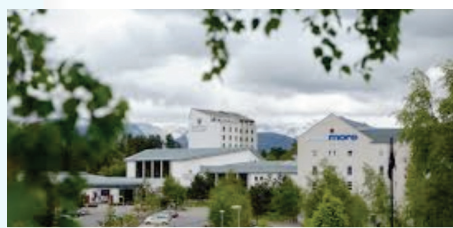
Macdonald Aviemore Hotel